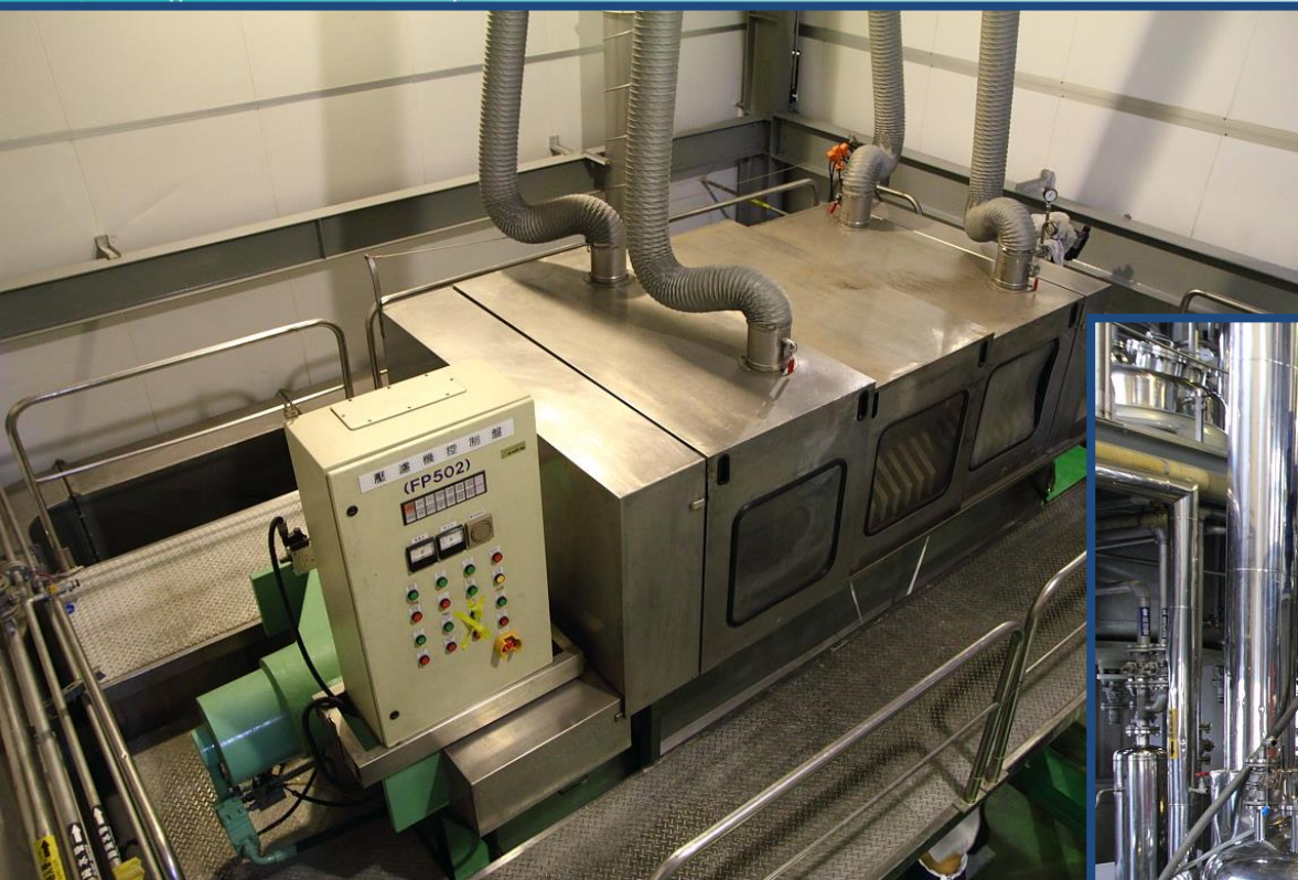
Filter Press for Biomass Separation