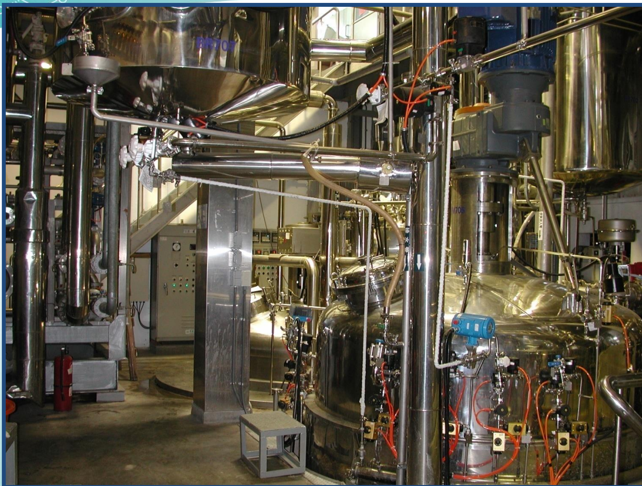
20,000 L & 30,000 L Fermentors