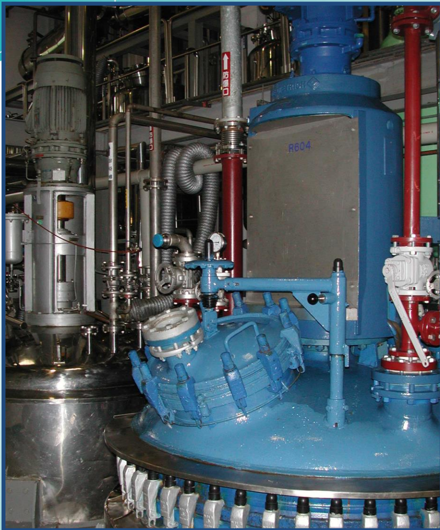
5,000 L Glass-lined and Stainless Steel Reactors for Purification Process