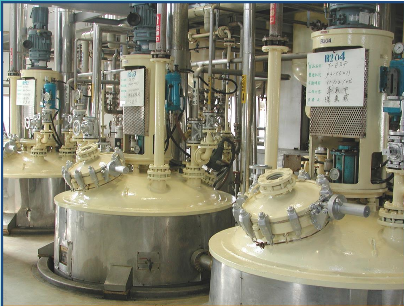
3,000 L Glass Lined Reactors