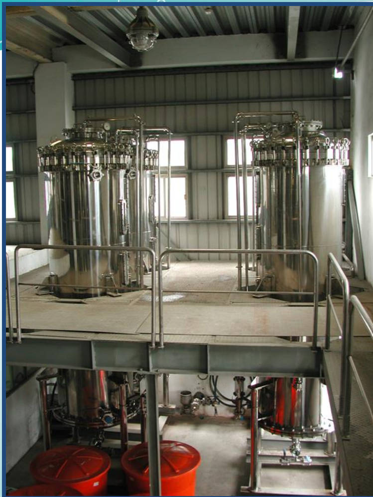
Recovery & Purification Equipment