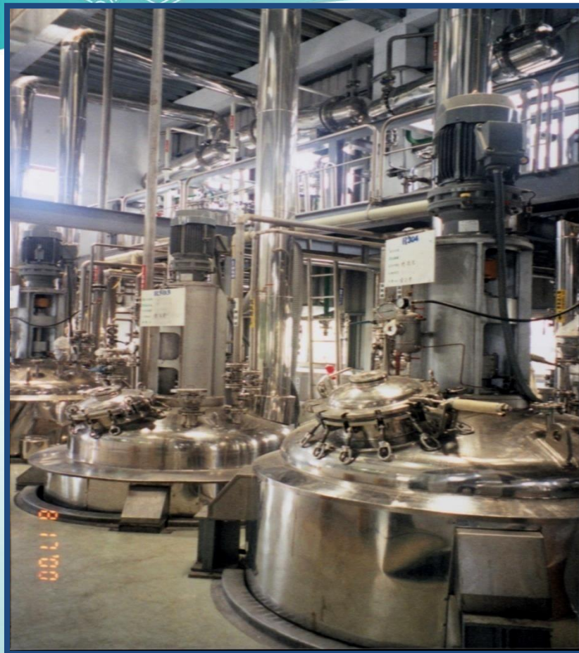
Stainless Steel Reactors