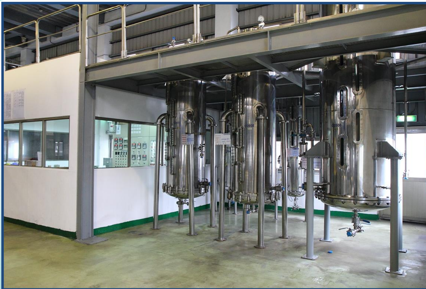
Columns for Purification