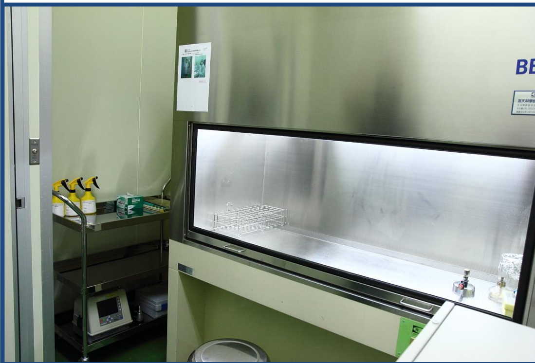
Laminar Flow Hood for Cell Expansion