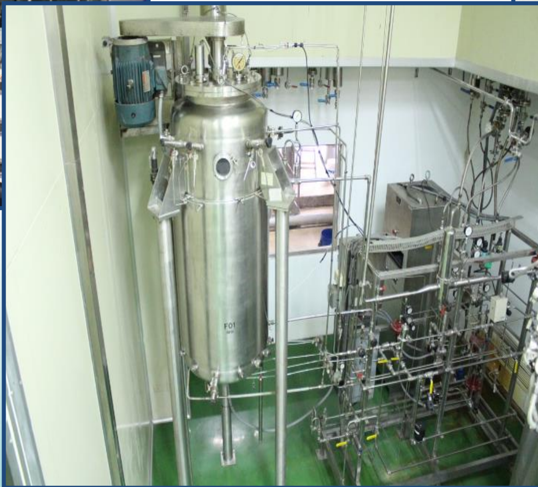
600 L Fermentor