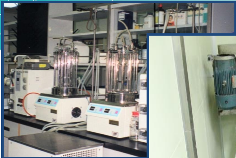
5 L Fermentor