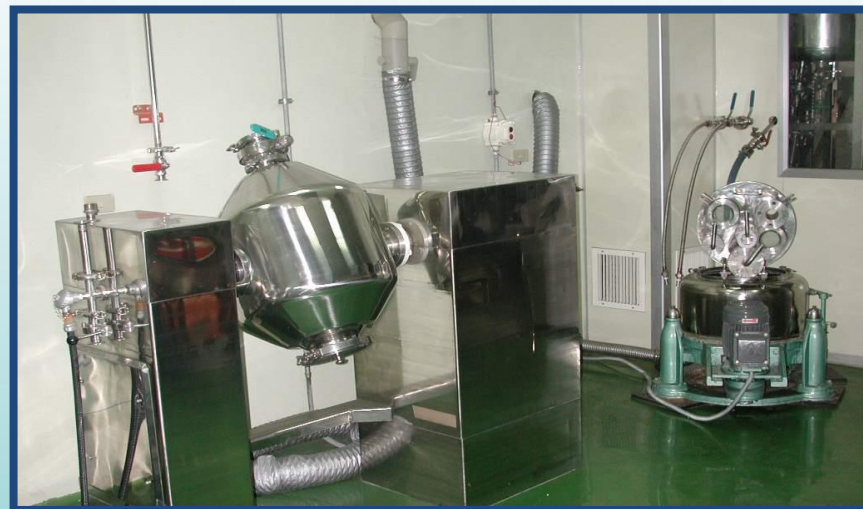
50 L Cone Dryer & 25" Centrifuge