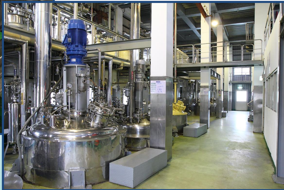
Reactors for Extraction/Concentration/...