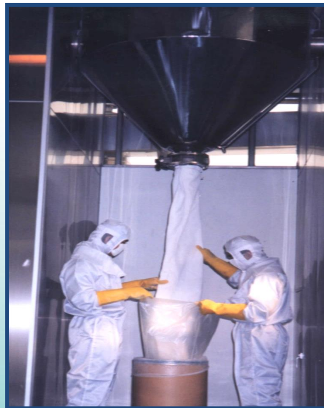
Cone Dryer in Controlled Room