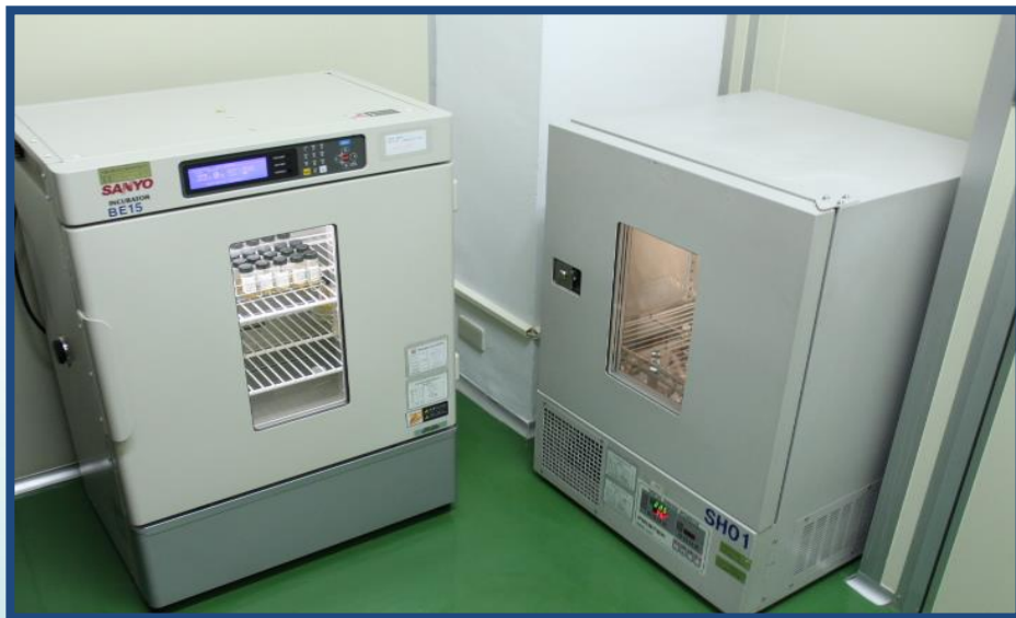
Incubator & shock box