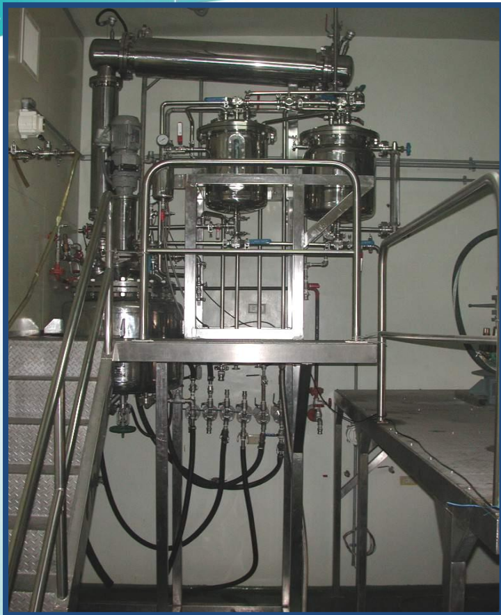
75 L Stainless Steel Reactor