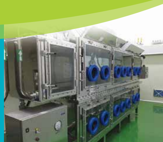
High Potency Facilities